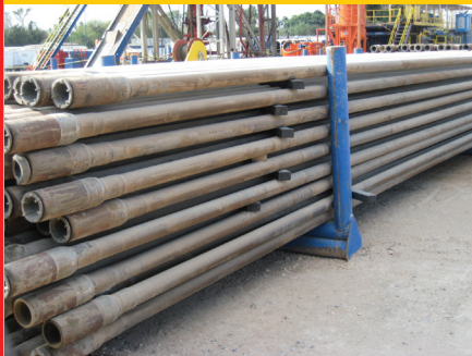
EXAMPLE OF RACKING BOARDS (TOP RIGHT), TRAILER FLOORING (ABOVE) AND PIPE STACKING (LEFT)

Rumber products are impervious to fluids, oil, and U.V. rays. They also repel gasoline, diesel, and other fuels, making them the perfect choice for oilfield uses.